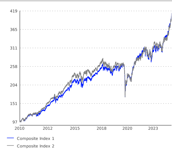
HISTORICAL INDEX LEVEL (Unhedged, in ZAR)