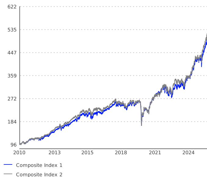
HISTORICAL INDEX LEVEL (Unhedged, in ZAR)