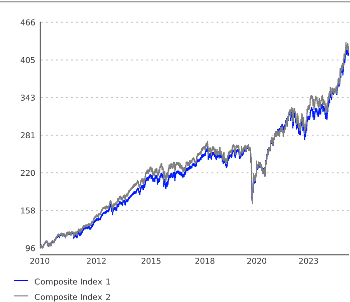
HISTORICAL INDEX LEVEL (Unhedged, in ZAR)